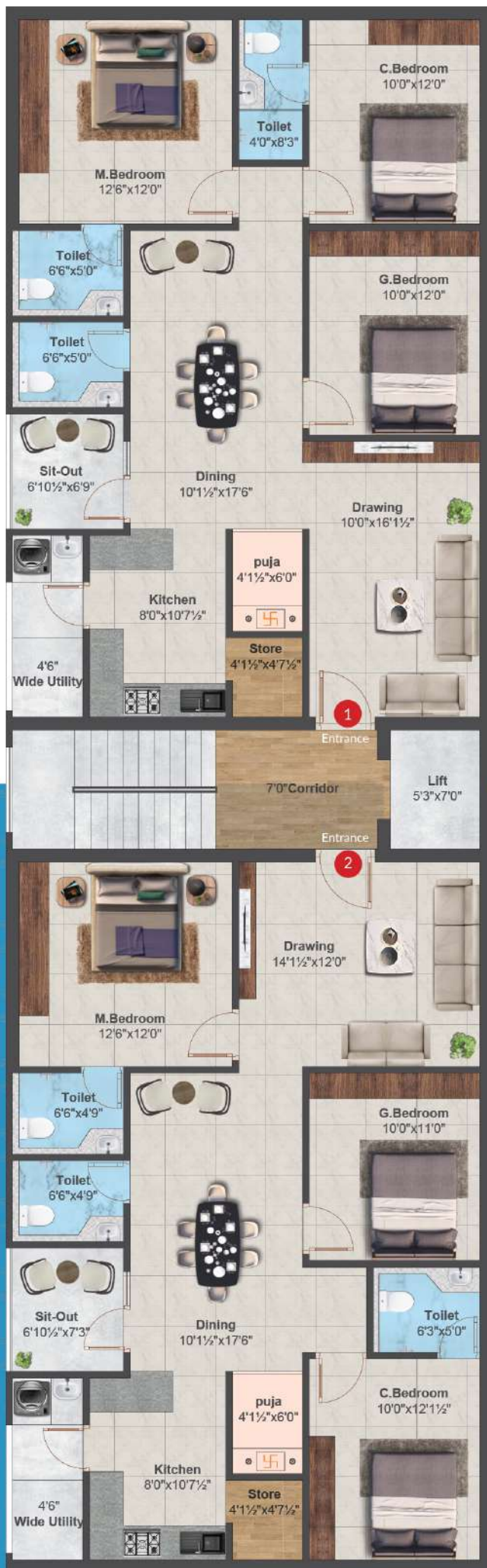
WEST-FACING PLAN - 1570 Sft.